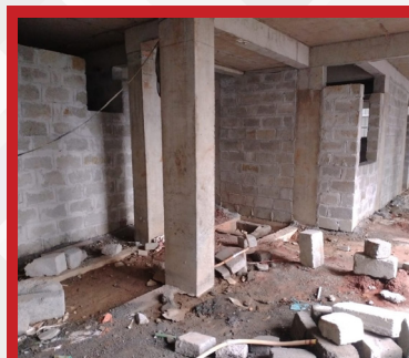
BLOCK D - Stilt Floor Rooms block work in progress