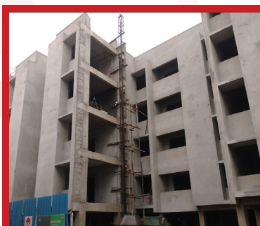
BLOCK D - North side External plastering work completed