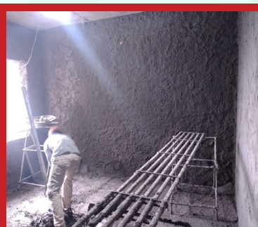
BLOCK D - 4th Floor Internal plastering work in progress