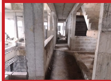
BLOCK B - 2nd Floor Block work in progress