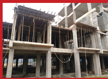
BLOCK A - 2nd Floor Slab shuttering work in progress