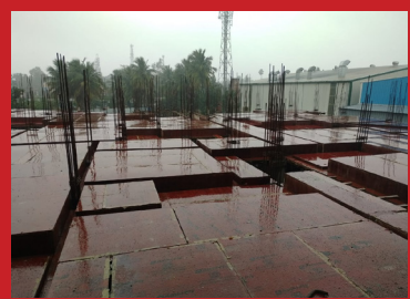
BLOCK A - 2nd Floor Slab shuttering work in progress