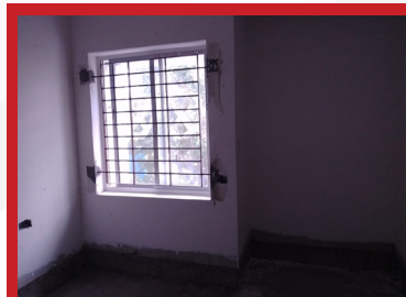
BLOCK C - 1st & 2nd Floor Window grill fixing work in progress