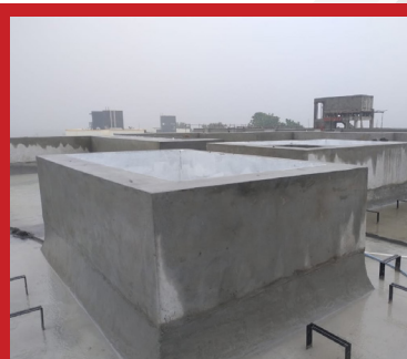
BLOCK C - Terrace Floor Waterproofing finishing work in progress