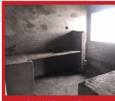
BLOCK D - 3rd Floor Internal plastering work completed