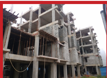
BLOCK B - 2nd Floor Block work in progress